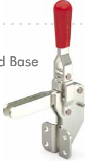
91090 Front Flanged Base Open Bar