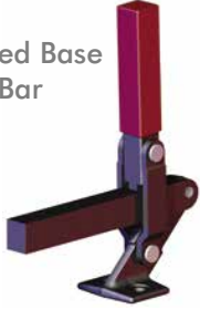
528 Flanged Base Solid Bar