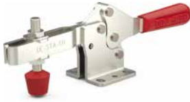
237-U Flanged Base U-Bar