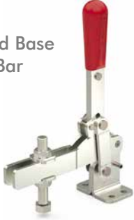
229 Flanged Base Open Bar