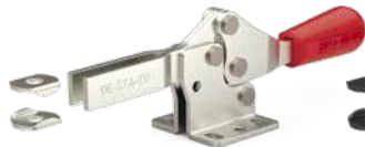
217-U-L-BLK ⓘ Flanged Base Open Bar