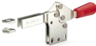
Straight Base Model 217-UB-L

See page MC-ACC-7 for Complete offering of Open bar accessories