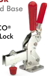
2010-UR Flanged Base U-Bar DESTACO® Toggle Lock Plus