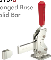
2010-S Flanged Base Solid Bar