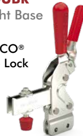
2010-UBR Straight Base U-Bar DESTACO® Toggle Lock Plus