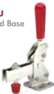
2010-U Flanged Base U-Bar