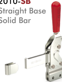
2010-SB Straight Base Solid Bar