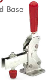
2010-U Flanged Base U-Bar