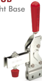
2010-UB Straight Base U-Bar