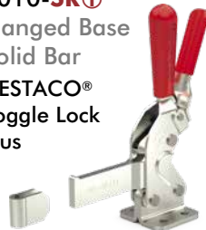
2010-SR ⓘ Flanged Base Solid Bar DESTACO® Toggle Lock Plus